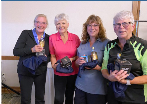
Most Honest Team

The 17 th Annual Lakeview Resort & Conference Centre Benefit Golf Tournament was held on August 23, 2021 at the Links of the Lake golf course in Gimli, MB. Once again, the Westshore Foundation was the grateful recipient of the event's proceeds. The 2021 event was a huge success.