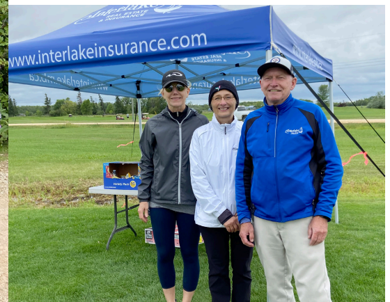
Two of our many sponsors